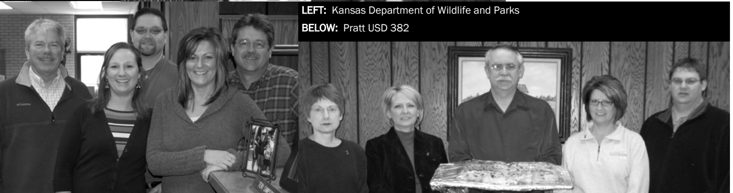
BELOW: Pratt USD 382