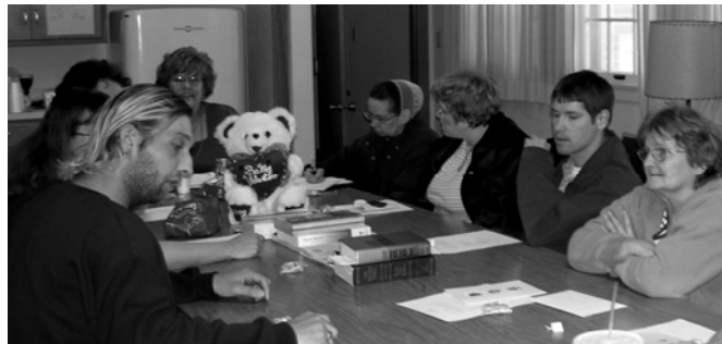
ABOVE: Members of PILR's Job Club meet.