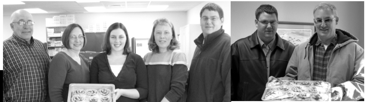
LEFT: Kansas Department of Wildlife and Parks

RIGHT: Pratt County Extension Service FAR RIGHT: J.A. Knight & Sons, Inc