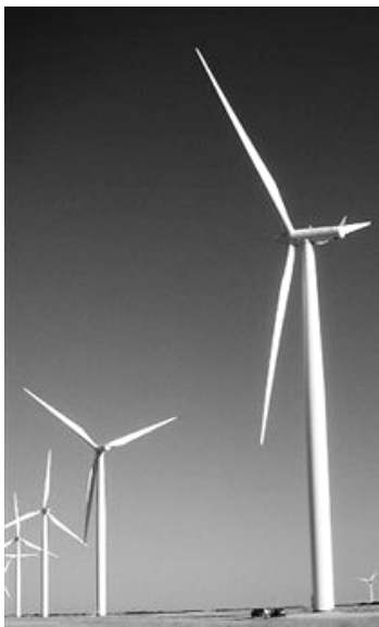
LEFT: Wind turbines located at Horse Hollow Wind Energy Center outside of Sweetwater.