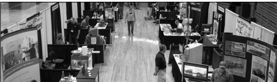
The 17th annual Mid-Year Meeting for Kansas Independent Oil & Gas Association (KIOGA) included a trade show at Pratt Community College on April 23, 2009. Sponsored, in part, by the Pratt Area Chamber of Commerce, the meeting brought some 150 oil and gas professionals to the Pratt.