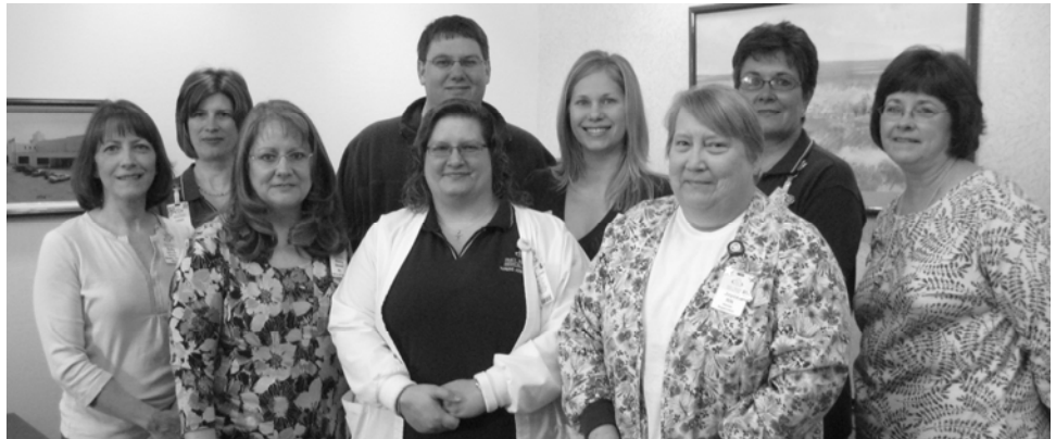
BELOW: Prairie Independent Living Resource Center